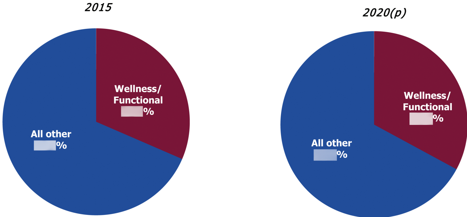
Wellness and Functional Beverages Share of Multiple Beverage Market Wholesale Dollar Sales 2015 and 2020(p)

Since 2015, wellness/functional beverages' share of the multiple beverage market wholesale dollar sales has grown by █ percentage points, from █% to █% in 2020. (The multiple beverage market includes alcohol.)